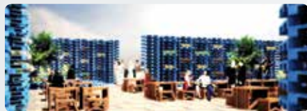
Once complete, the distinctive blue pallets of the Summer Pallet Pavilion will host up to 200 guests on the old Crowne Plaza site at the top of Victoria Street in central Christchurch.

The Summer Pallet Pavilion is a visually engaging and dynamic space that hosts live music, outdoor cinema and a wide range of other events. Built from nearly