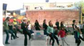
The Dance-O-Mat has proven very popular with Christchurch residents following the demolition of several central-city dance studios.

It needed to be a robust, outdoor installation so we provided galvanised pipes and fittings to house the electrical cables connecting the dance floor, lighting and sound systems, and sections of bent steel plate to serve as ramps over the pipe.