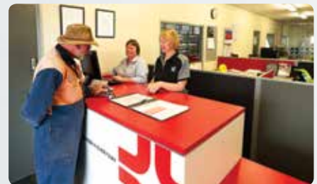
Steel & Tube has consolidated its three Nelson operations into a single new facility.

As well as being a positive move for the business, the consolidation is seen as an improvement for the region and the new facility has already significantly enhanced Steel & Tube's profile in Nelson.