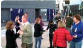
Organisers and volunteers enjoy the Dance-O-Mat's opening night in central Christchurch.

Dance-O-Mat is a dance floor with a coin-operated lighting and sound system courtesy of a converted washing machine (a laundromat, hence the name). Anyone can use the site, plug in their MP3 player and start dancing. Organisers say the project was created in response to the loss of many of the dance studios and performance spaces around the city.