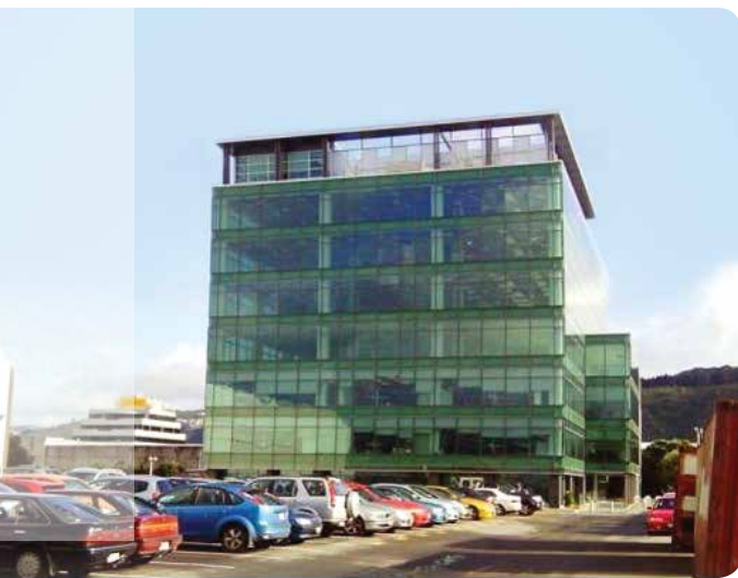
Steel & Tube's National Support Centre has relocated to the IBM Building in Petone, the Hutt Valley's only Green Star-rated commercial building.