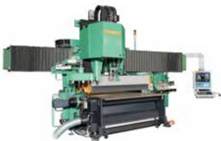
The new Peddinghaus high-speed plate processor greatly extends our capability in efficient CNC machining, milling and part marking.

Our new Peddinghaus high-speed plate processor offers plasma or oxy-fuel cut components, plus CNC drilling, machining, tapping, part marking, countersinking, milling and several other services. The machine's common line cutting and efficient nesting techniques minimise scrap and reduce the cost to customers.