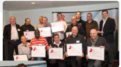
Award recipients enjoy Steel & Tube's inaugural Workplace Safety Awards dinner.

Although this was the first Workplace Safety Awards presentation, the programme has already had a positive affect on the business. The programme reflects our heightened awareness and behaviour of the safe practices expected of our staff, contractors and visitors to ensure that everyone gets home safely at the end of the day.