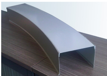
CURVED PARAPET CAPS