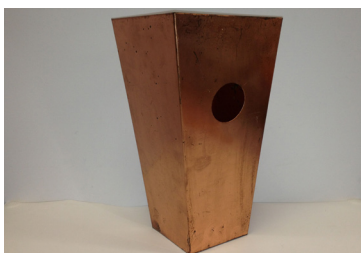
RAIN WATER HEADS