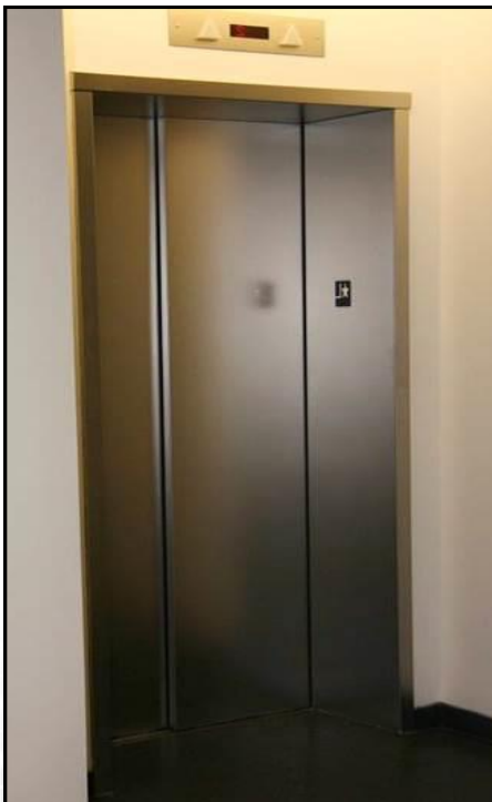
Granex used for lift doors