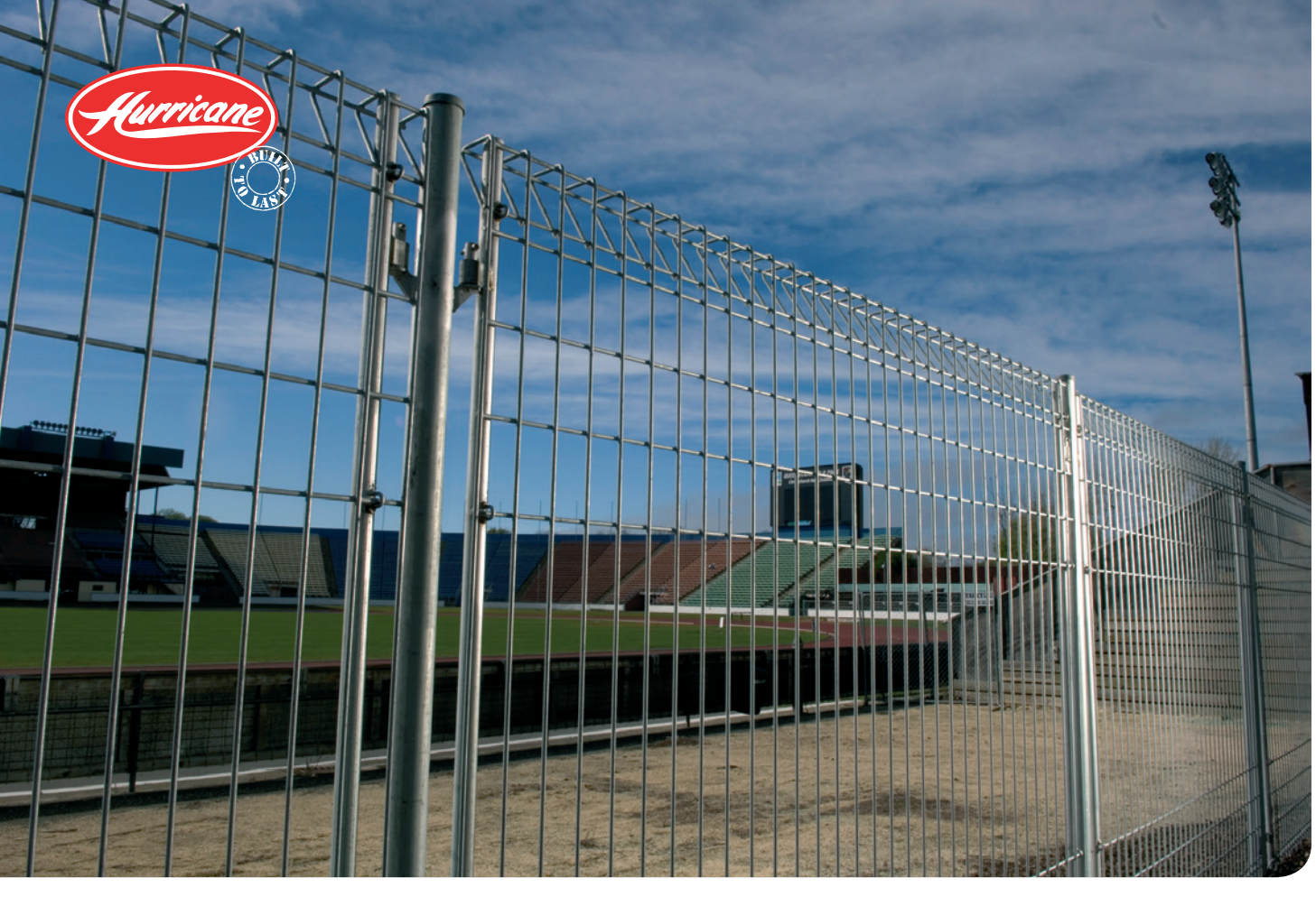
Hurricane fence panels are an attractive slimline profile offering a strong and safe fencing system.