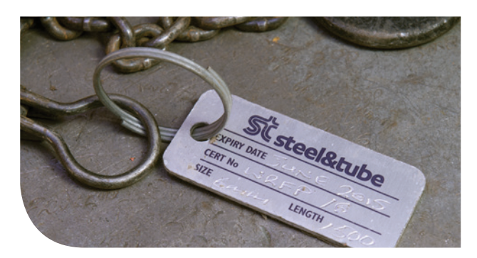
Compliancy tag for tested equipment.