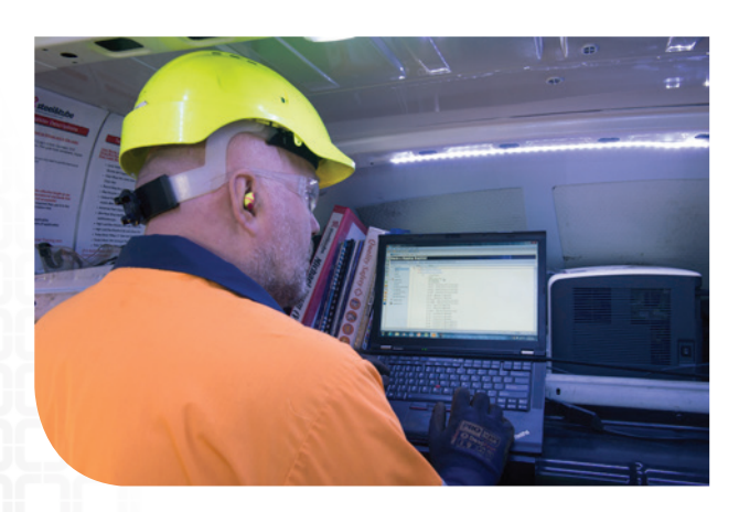
Technician updating the customer register upon completion.

All testing carried out is immediately updated onsite into the electronic testing register. The register records the locations and status of all items, including any that may have failed a test. The register is accessible online realtime for your convenience.