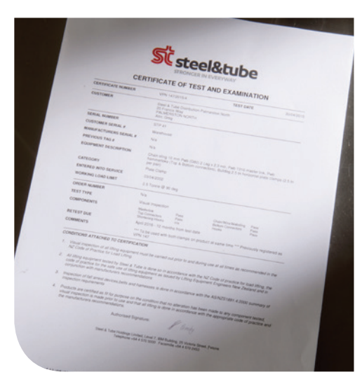
Test certificate printed onsite.

Test certificates are available on site at the time of testing or can be stored electronically for future reference.