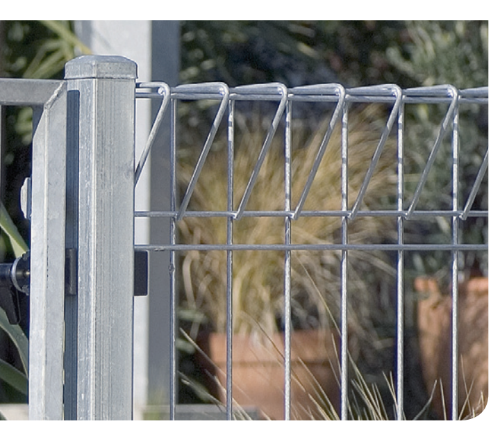
Fold top panels are the accepted profile recognised as a superior fence solution.