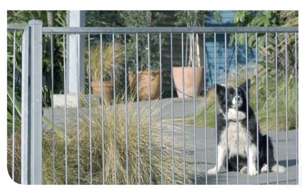
Square top panels are an attractive new slimline profile offering a modern style of home fencing.

An attractive and effective result can be achieved by using either the fold top or square top panels, used in conjunction with Home Fence square posts which have a flanged option, enabling the post to be secured to existing paving or deck. Add to this the free swinging simple catch home fence gate and excellent results can be achieved.