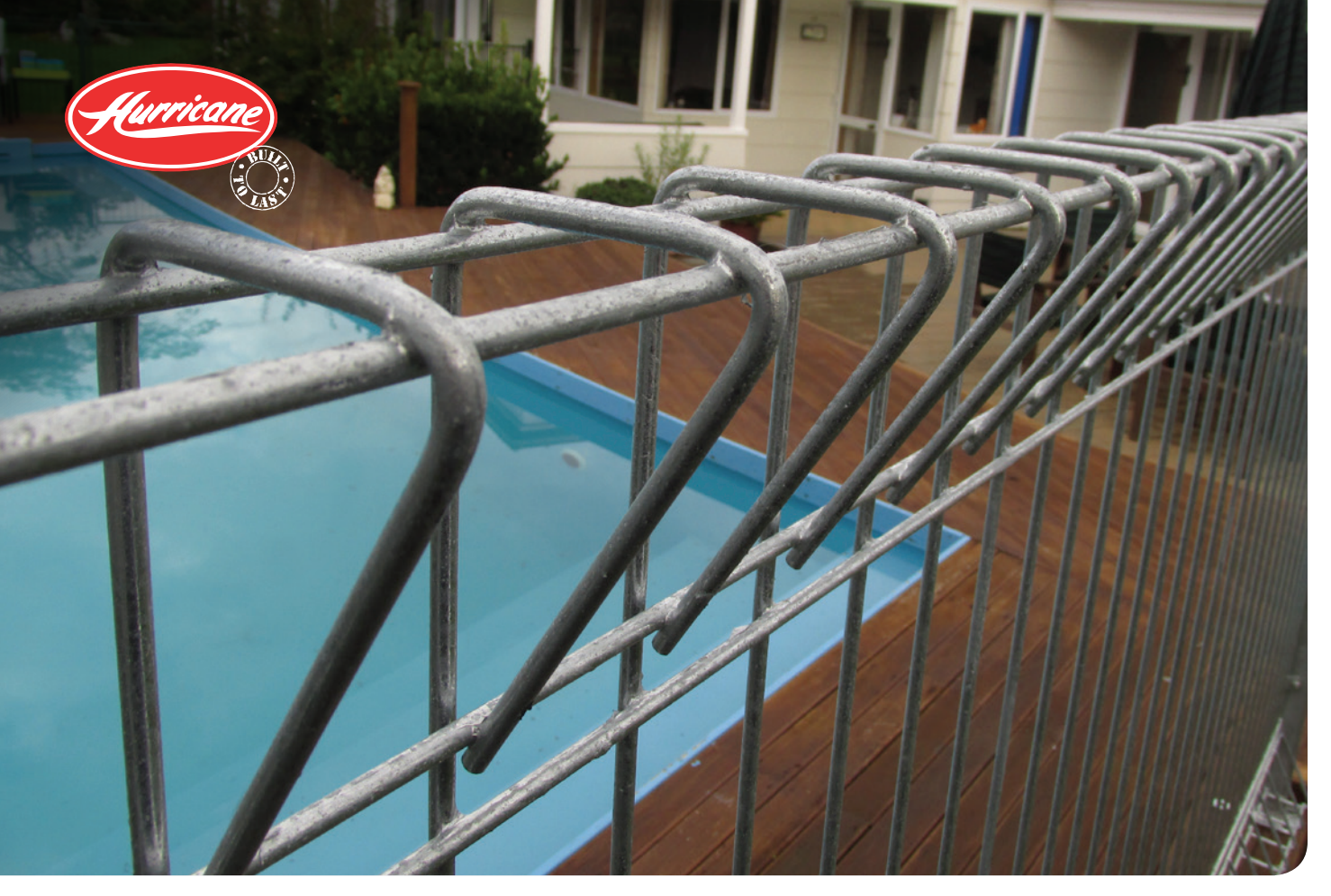
Hurricane fence panels are an attractive slimline profile offering a modern style of home and pool fencing.