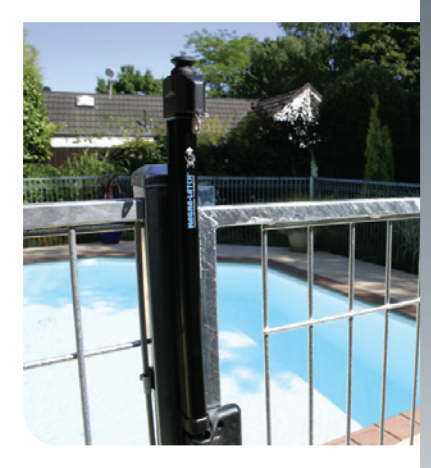
Pool Gate Latch with child proof opening mechanism.