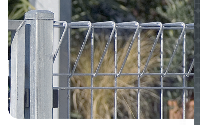
Fold Top Panels are the accepted profile recognised as a superior home and pool fence solution.