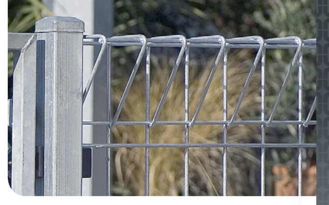
Standard fold top detail (top and bottom).