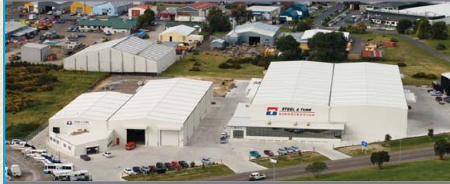
New premises for Distribution and Roofing in Mt Maunganui