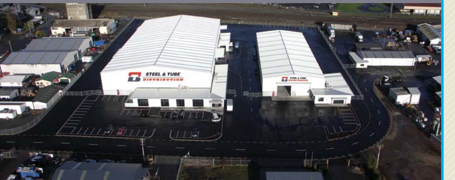
New premises for Distribution and Roofing in Hamilton